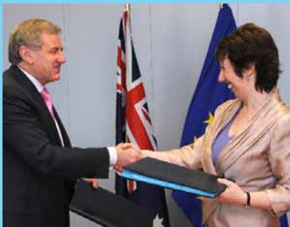
Trade Minister Simon Crean and EU Trade Commissioner Catherine Ashton at the initialling of the reviewed Mutual Recognition Agreement (MRA) in Brussels on 23 June 2009

ACTION 14: Jointly develop a program in 2010 to support the measures taken by South East Asian developing nations to implement the actions agreed under the Regional Plan of Action (RPOA) to Promote Responsible Fisheries and Combat Illegal, Unreported and Unregulated Fishing (IUU) in the area. Desired Outcome: Sustainable fisheries management and more effective governance in countries endorsing the RPOA (particularly Brunei, Cambodia, East Timor, Indonesia, PNG, Thailand, the Philippines, and Vietnam), promoting more sustainable management of fisheries resources and food security in the region.