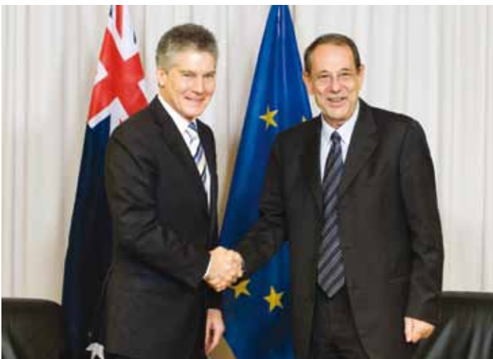
Australian Foreign Minister Stephen Smith and the High Representative for Common Foreign and Security Policy and Secretary-General of the Council of the European Union, Dr Javier Solana.