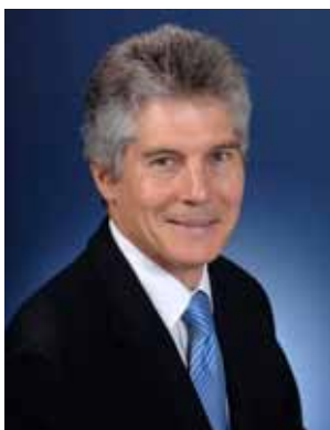
Minister Stephen Smith

The European Union (EU) is an important partner for Australia. We share common approaches to many of the world's most pressing international challenges, from non-proliferation to climate change, and work together in responding to them.