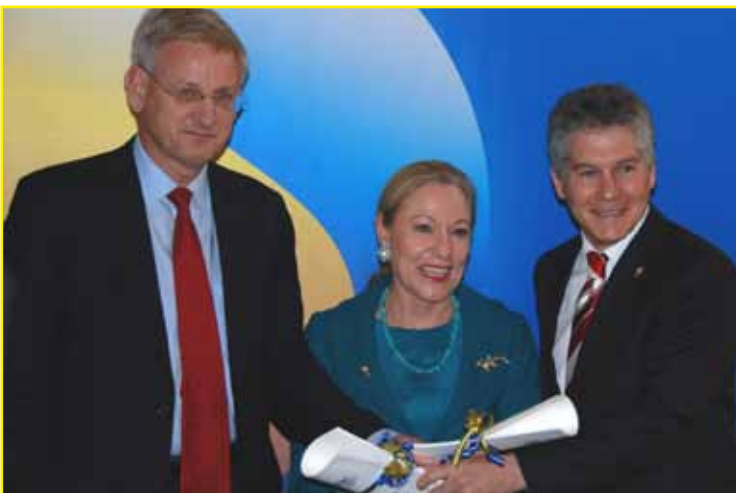
Sweden's Foreign Minister Carl Bildt (left); European Commissioner for External Relations Benita Ferrero-Waldner; and Australian Foreign Minister Stephen Smith at the Australia-EU ministerial consultations in Stockholm.