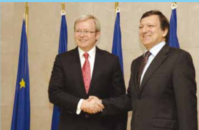
Australian Prime Minister, Kevin Rudd, and European Commission President José Manuel Barroso.

ACTION 6: Increase cooperation between the EU and Australia in international migration and asylum fora , as well as in bilateral relations with third countries of high strategic interest for both partners including on issues such as people smuggling and irregular migration. Desired Outcome: Through opportunities such as the Senior Officials' Dialogue on Migration, Asylum and Diversity Issues, focus bilateral technical cooperation on issues related to facilitated mobility, enhanced security, new technologies and information sharing.