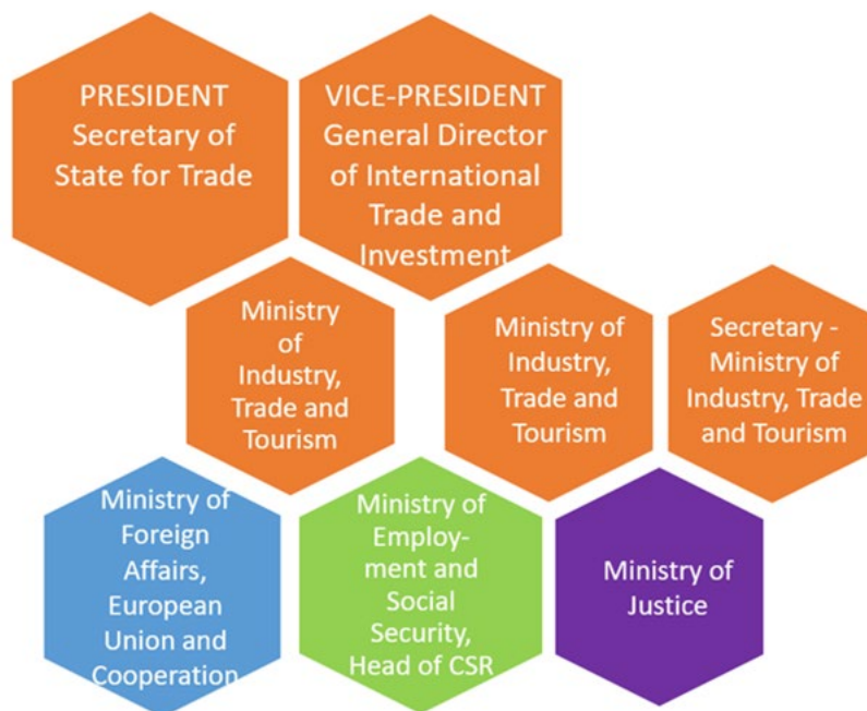
Figure 3.1. The current members of the Spanish NCP's IMCB

Note: the questionnaire is provided by the NCP under review during the peer review preparatory phase